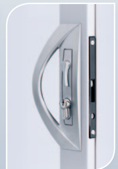
Available in all colours